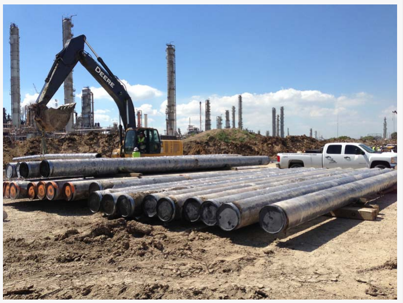
Southwest Pipe Services Inc Environmental Services for Pipeline Abatement

Southwest Pipe Services, Inc. (SWP) is an environmental service company specializing in the mechanical removal of pipe coatings. Our services are performed for many clients in the oil and gas, petrochemical, and energy industries. We can perform these services at our Alvin, TX, or Winfield, KS facilities. Southwest Pipe Services can even mobilize to a client's job site or facility and perform cleaning services on-site. Many of the coatings we remove are classified as regulated waste by the U.S. Environmental Protection Agency (EPA), (pipelines)