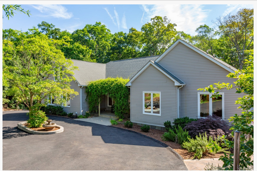
1009 Featherston Ct., Fredericksburg, VA 22401