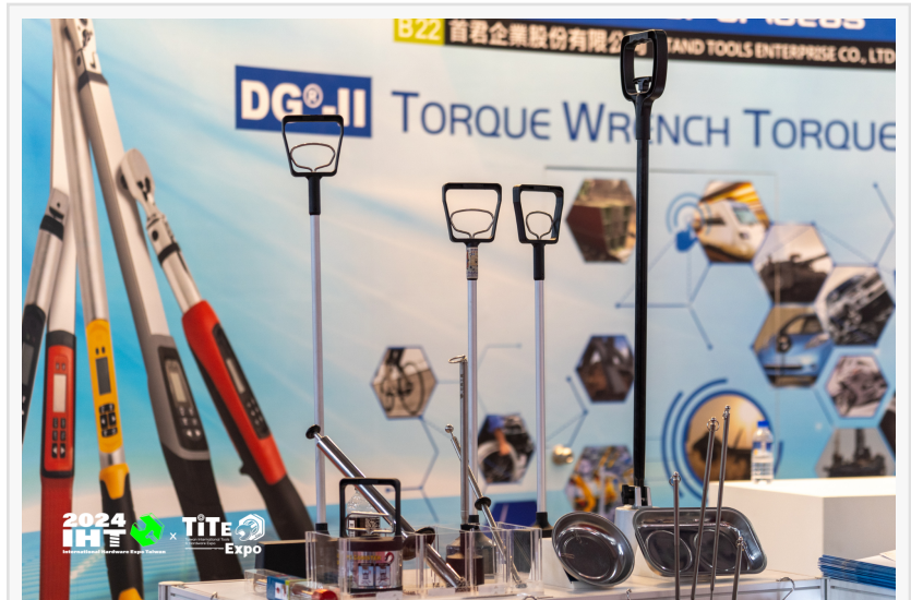
The digital torque wrench offers high precision and efficiency for model assembly and precision machinery maintenance.

Jointly organized by the esteemed Lanza International Co., Ltd and the Taiwan Hand Tool Manufacturers' Association, IHT x TiTE highlights Taiwan's comprehensive hardware industry ecosystem to global buyers, tapping into new post-inflation economic opportunities. This year's exhibition will feature seven key themes: 1) Tools & Related Accessories, 2) Automotive Parts, Repair Tools & Maintenance Equipment, 3) Fasteners & Fixings, 4) Garden, Outdoor, Agricultural, & DIY, 5) Metal Testing Equipment, Processing Equipment, & Industrial Safety, 6) Building & Locks, and 7) Industrial Software & Digital Transformation. With over 400 exhibitors from more than 20 countries and hundreds of international brands and distributors, the event promises to be a spectacular showcase. For the latest exhibition information, please visit the official website