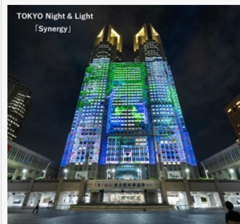
A New Gem in Tokyo's Tourism_1

Using 40 state-of-the-art visual and audio instruments, the artwork displays abstract images of flower heads, petals and other plants that pulsate and swirl over images of the building's exterior while also warping and melting to the beat of the music of a fast-paced electronic symphony. In the finale, twigs and branches tangle up into a full-foliaged tree.