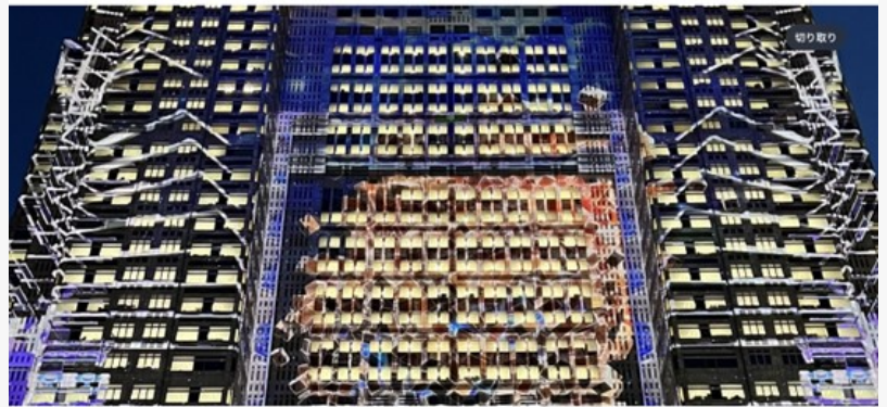
TOKYO Night & Light [Synergy]

The Guinness World Records™ organization has recognized the project as the “largest architectural projection-mapped display (permanent).” The nightly show is projected onto an area, 127 meters high and 110 meters wide, on the front of the TMG No. 1 Building -- from its fourth to 32nd floors. The building, designed by the late architect TANGE Kenzo and completed in late 1990, is split into two towers from the 33rd floor and upward. Its exterior resembles an