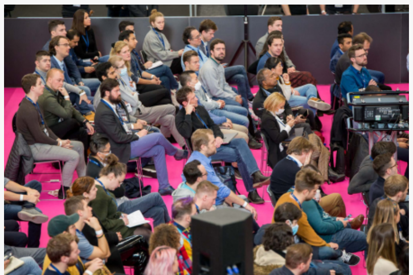
Digital Transformation Week Europe

AMSTERDAM, NORTH HOLLAND, NETHERLANDS, June 25, 2024 /EINPresswire.com/ -- Digital Transformation Week Europe , the leading event for exploring the latest advancements in Digital Transformation, is pleased to announce an esteemed line-up of speakers for the expo, which is set to take place on 1-2 October 2024 at RAI, Amsterdam.