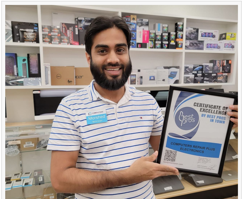
Computers Repair Plus Electronics - an employee holds a Certificate of Excellence from Best Pros In Town

For more information about Best Pros In Town and to view the list of award-winning businesses,