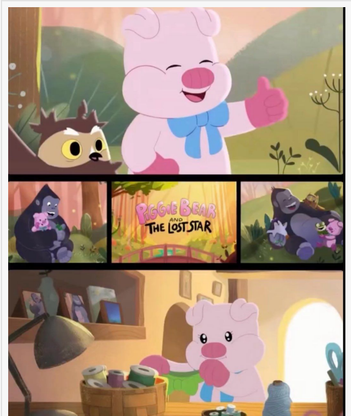
An image from the film Piggie Bear and The Lost Star

The film was selected from over 13,000 entries and deemed as one of the most innovative stories being told across all screens. Established in 1979, The Telly Awards receives over 13,000 entries from 50 states and five continents. Entrants are judged by The Telly Awards Judging Council—an industry body of over 200 leading experts including advertising agencies, production companies, and major television networks. More information can be found at the Telly Awards press center .