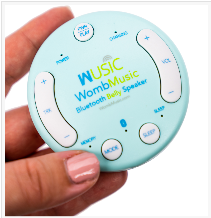
Best Selling Bluetooth Belly Speaker by Wusic

The Wusic Bluetooth Belly Speaker, with its compact and lightweight design, ensures comfort for mothers and offers high-quality audio output for an immersive sound experience. Features