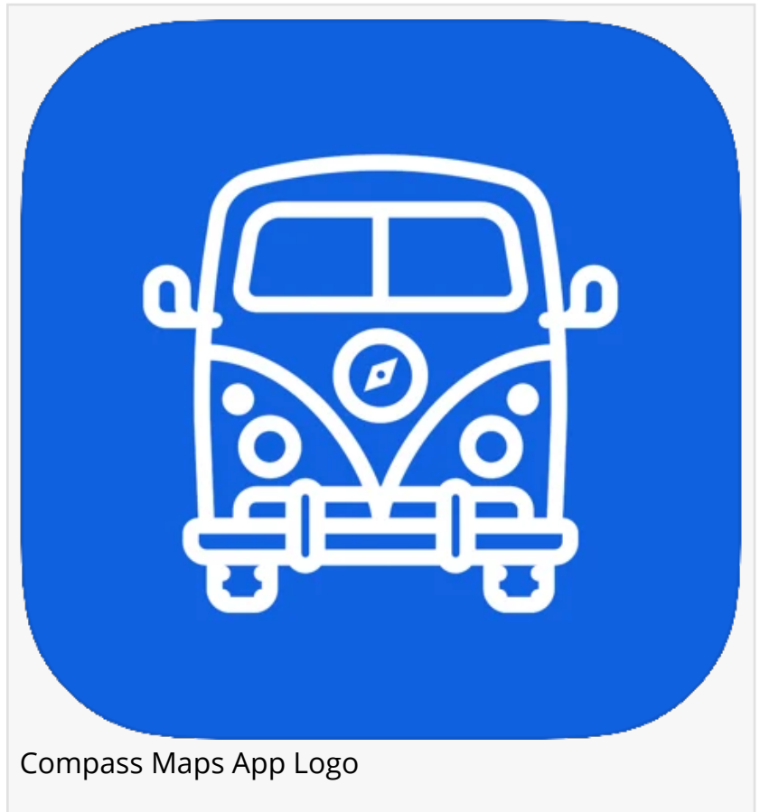
Compass Maps App Logo

Compass Maps: Turning Summer Drives into Scenic Adventures