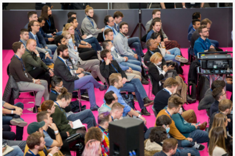
Cyber Security & Cloud Expo Europe

AMSTERDAM, NORTH HOLLAND, NETHERLANDS, June 26, 2024 /EINPresswire.com/ -- Cyber Security & Cloud Expo Europe , the leading event for exploring the latest advancements in Cyber Security & Cloud technology, is pleased to announce an esteemed line-up of speakers for the expo, which is set to take place on 1-2 October 2024 at RAI, Amsterdam.