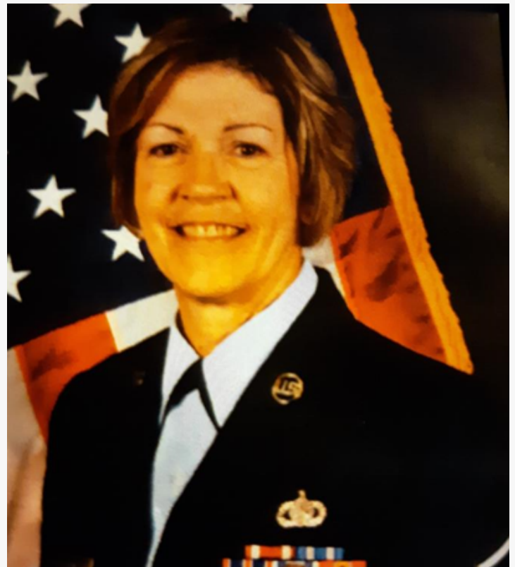
Master Sergeant in the Air Force and Air National Guard