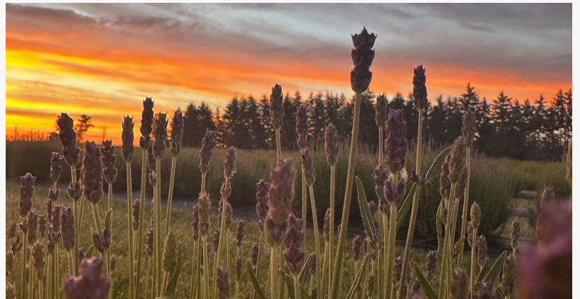
Enjoy the lavender fields at sunset