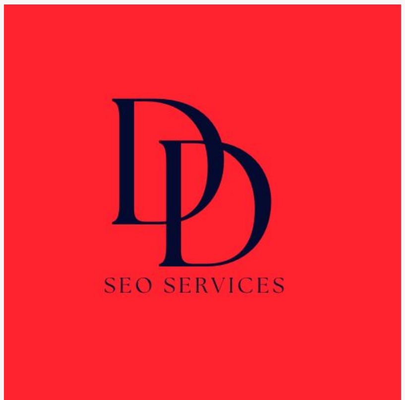
D&D SEO Services Logo

FORT MYERS, FL, USA, June 27, 2024 /EINPresswire.com/ -- D&D SEO Services, a leading local SEO agency with over a decade of experience, today announced a new suite of AI-powered local SEO packages specifically designed to help small businesses overcome the challenges of online visibility and customer acquisition. Recognizing that small businesses are the cornerstone of communities, D&D SEO Services is committed to providing them with the tools and strategies necessary to thrive in the digital landscape.