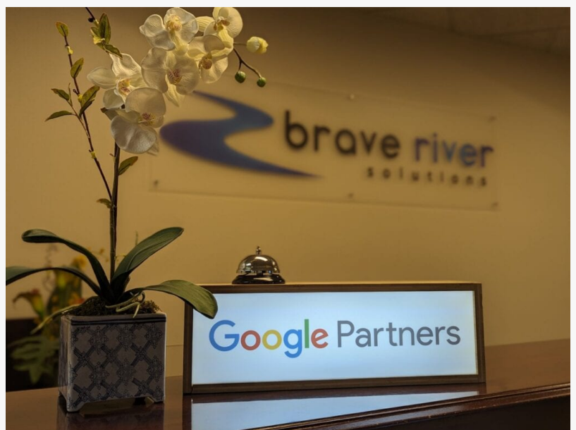
Brave River Solutions is a Google Partner Agency and a member of the Google Ads Advisors community.

To earn this seal of approval from Google, digital marketing agencies must consistently deliver exceptional results, demonstrate unparalleled expertise across the Google advertising suite, complete and pass multiple hours-long exams, and meet rigorous ad performance benchmarks.