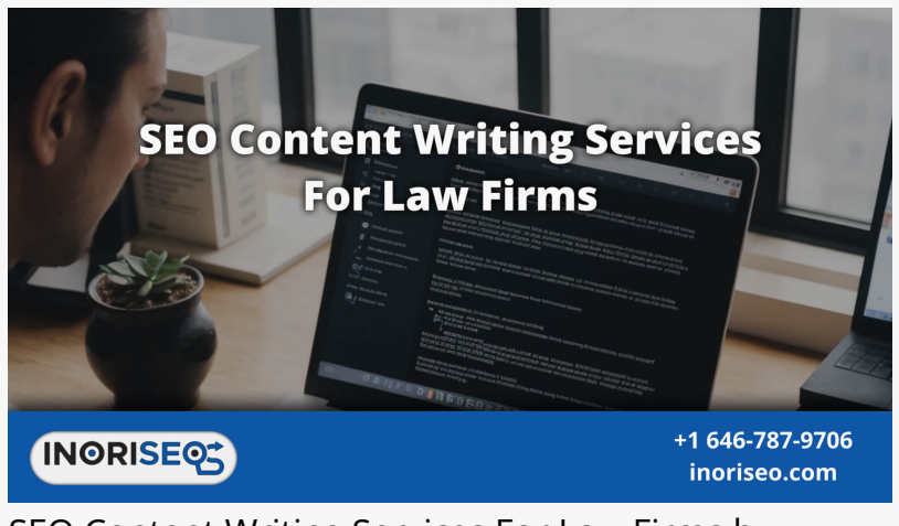
SEO Content Writing Services For Law Firms by Inoriseo