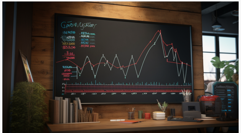
Inventory Management for Ecommerce Sellers - The Math

COEUR D ALENE, ID, UNITED STATES, June 26, 2024 /EINPresswire.com/ -- Inventory Boss, a leading provider of inventory management solutions for ecommerce sellers, announces the release of its latest guide in the educational series. This new guide delves into the concept of reorder points, explaining why they are crucial for ecommerce sellers to maintain optimal inventory levels and prevent stockouts.