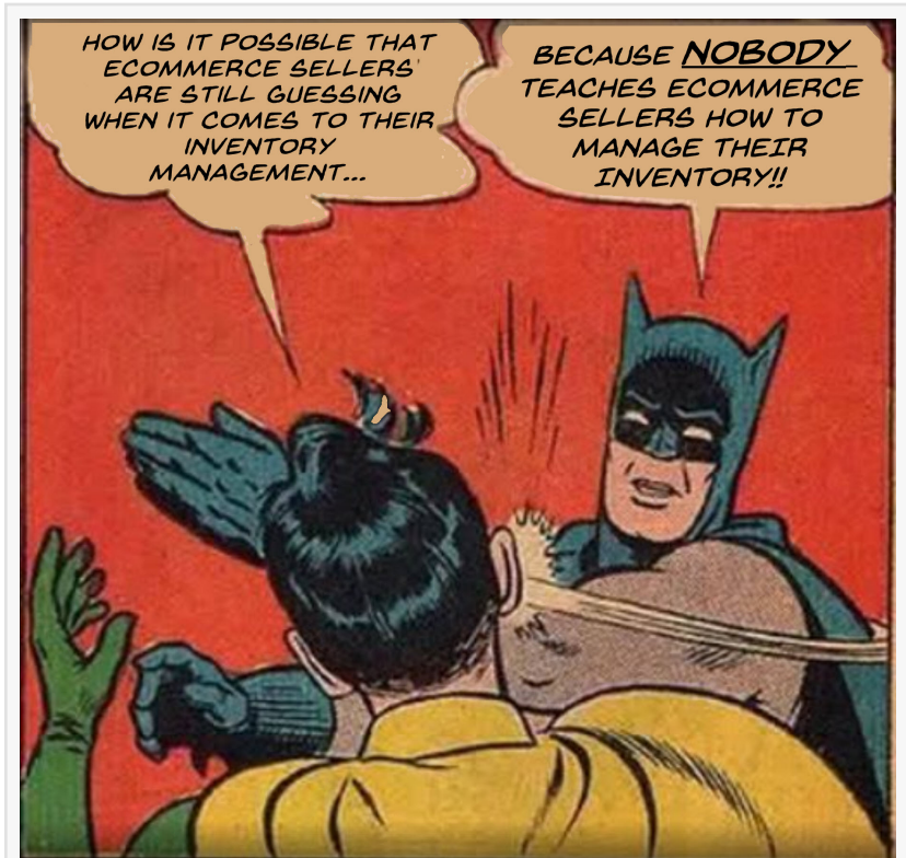
Nobody Teaches Inventory management to ecommerce sellers