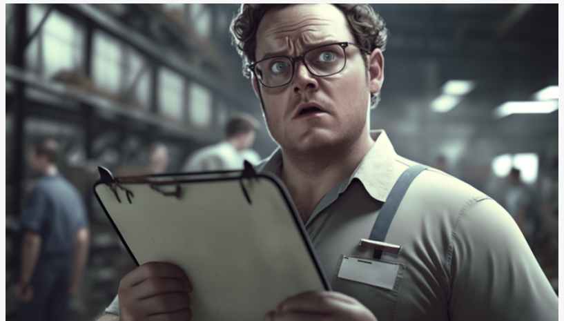
Inventory Management for Ecommerce Sellers - It Pays to Know Your Numbers!

COEUR D'ALENE, ID, UNITED STATES, June 26, 2024 /EINPresswire.com/ -- Inventory Boss , a leading provider of inventory management solutions for ecommerce sellers, announces the release of the latest guide in its educational series: "Calculating Safety Stock for Ecommerce Inventory Management." This new blog article is part of Inventory Boss's ongoing effort to provide valuable insights and training to help ecommerce businesses optimize their inventory management practices.