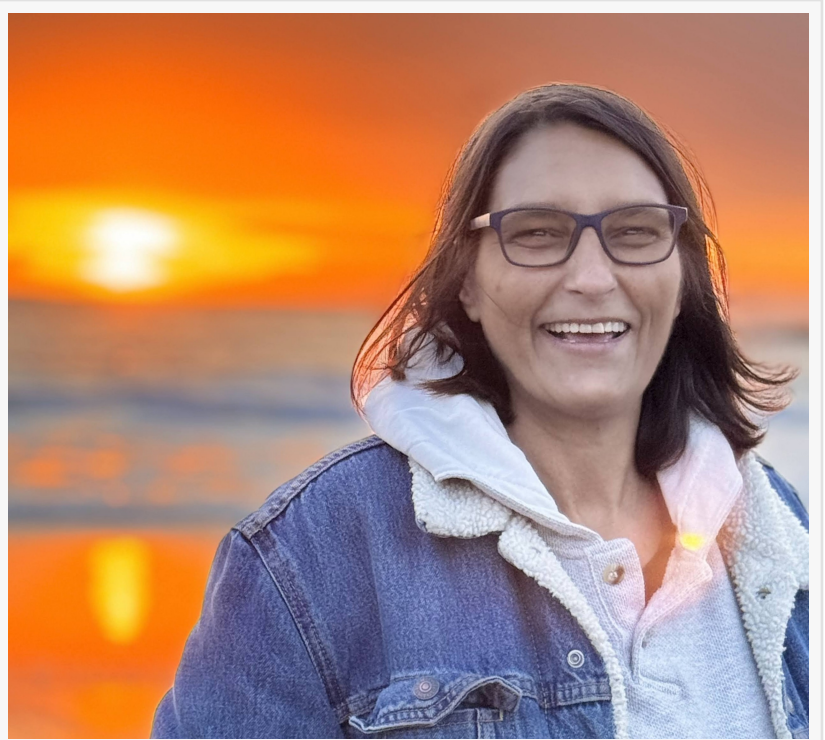
ResilientAF Press - Because we are ALL ResilientAF!

Pre-sales for Not My Circus are now available on www.delicianiami.com and will soon be available via Amazon . Don't miss the chance to be among the first to experience this unforgettable journey of hope, courage, and transformation.