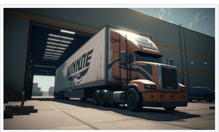
Inventory Management for Ecommerce Sellers -Understanding Lead Time

COEUR D ALENE, ID, UNITED STATES, June 26, 2024 /EINPresswire.com/ --<u>Inventory Boss</u>, a leading provider of inventory management solutions for ecommerce sellers, has released the latest guide in its comprehensive training series. This new guide focuses on the importance and methodology of integrating multi-platform ecommerce