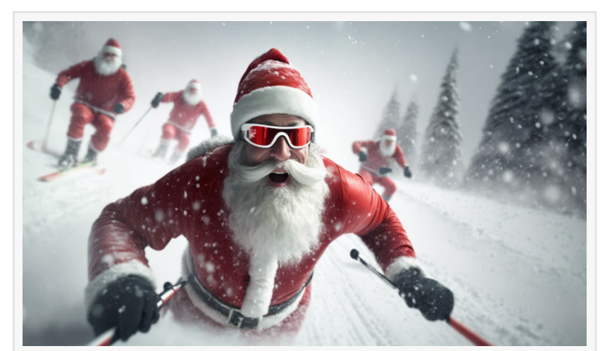
Inventory Management for Ecommerce Sellers - How to Build a Seasonality Index

COEUR D'ALENE, ID, UNITED STATES, June 26, 2024 /EINPresswire.com/ -- Inventory Boss, a leading SaaS provider of inventory management software solutions and training for ecommerce sellers, has released its latest educational guide. The new article, titled "Adapting Inventory Strategies for Seasonal Peaks," is designed to help