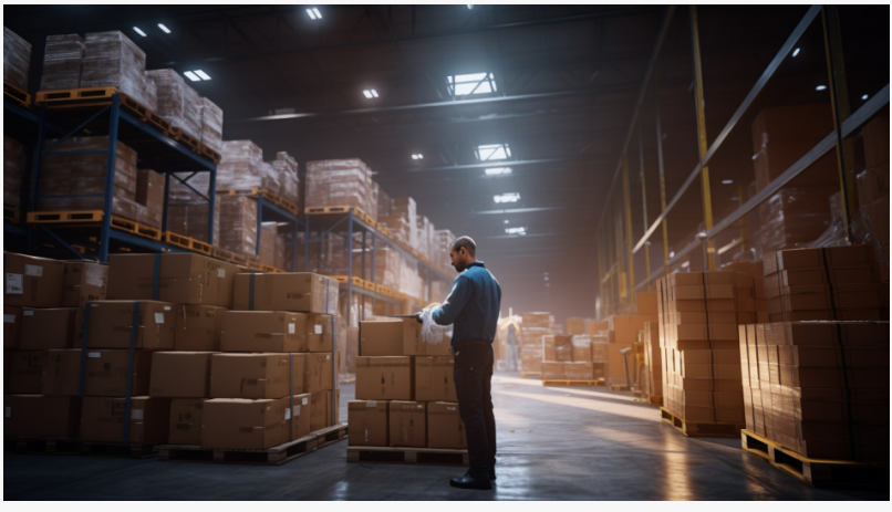
Calculating the Advanced Reorder Point

"Our 8-step system is designed to provide a clear and actionable roadmap for ecommerce sellers. By following these steps, sellers can ensure they have the right products in the right