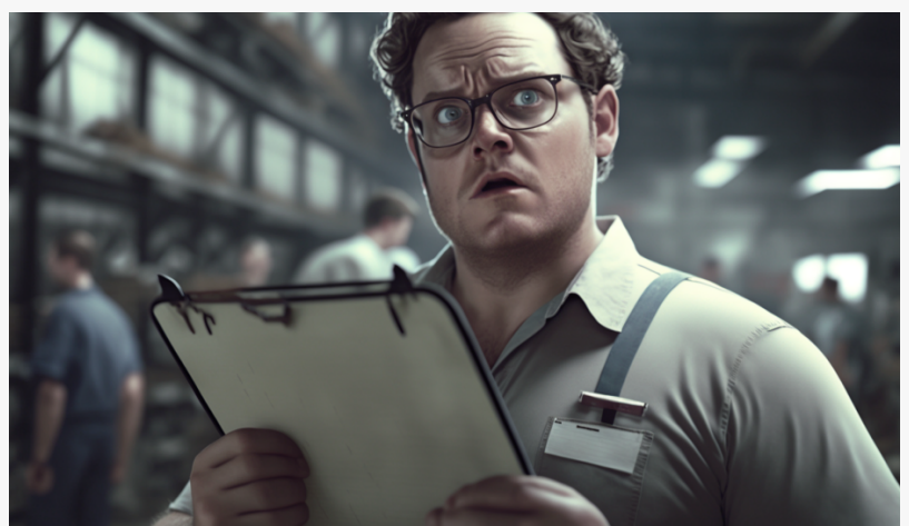
Inventory Management for Ecommerce Sellers - It Pays to Know Your Numbers!