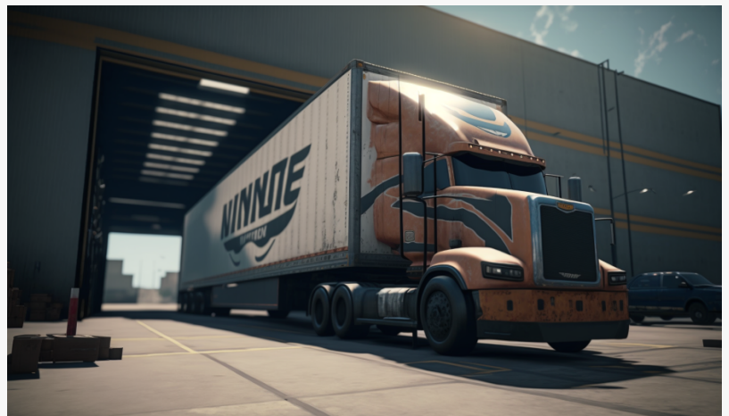
Inventory Management for Ecommerce Sellers - Understanding Lead Time