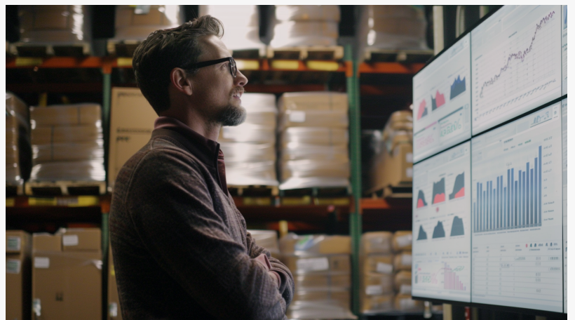
Inventory Management Software for Ecommerce

their inventory management. These tools provide real-time data, automate repetitive tasks, and offer analytics that support better decision-making."