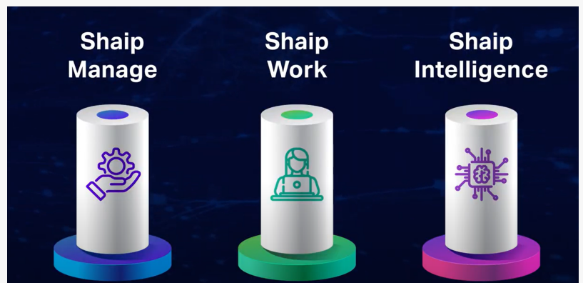
Shaip Manage, Work, Intelligence

Shaip Manage empowers project managers to define precise data collection parameters, set diversity quotas, manage volumes, and establish domain-specific requirements. This app streamlines the alignment of project goals with the right vendors and workforce, guaranteeing that the collected data meets the highest standards of diversity, ethics, and quality.