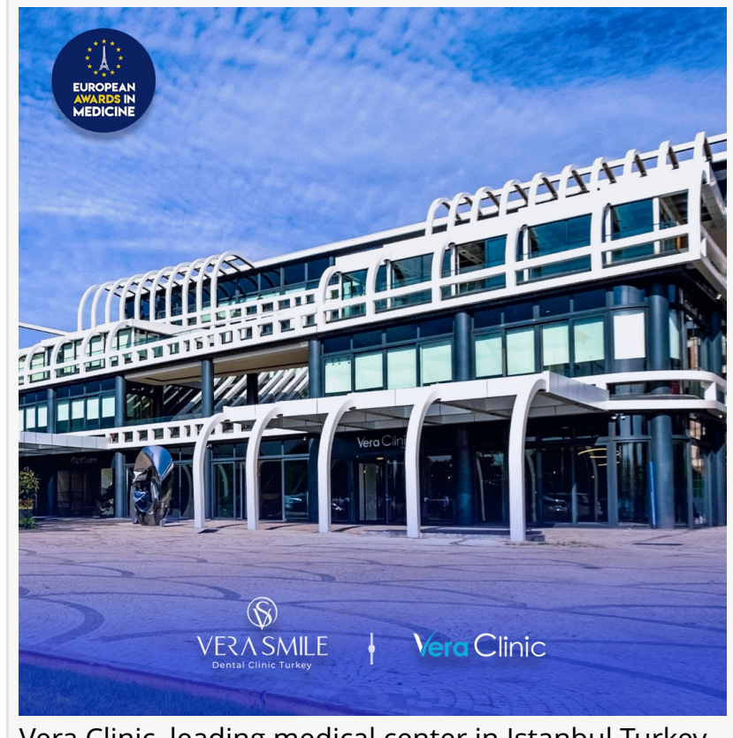
Vera Clinic, leading medical center in Istanbul Turkey

The article provides an in-depth analysis of why Turkish dental clinics