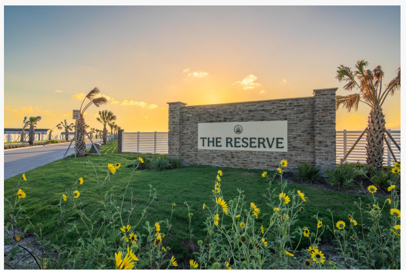
The Reserve at Costa Palms and Copano Bay communities offer vibrant coastal living, affordable luxury, and direct access to Copano Bay.

The Reserve, a collection of residential communities, is committed to creating exceptional residential communities in top housing markets across Texas. The Reserve operates under Stonetown Capital, a Denver-based real estate investment firm focused upon opportunities in the manufactured housing and recreational vehicle sectors. Learn more at thereservecommunities.com and stonetowncapital.com .