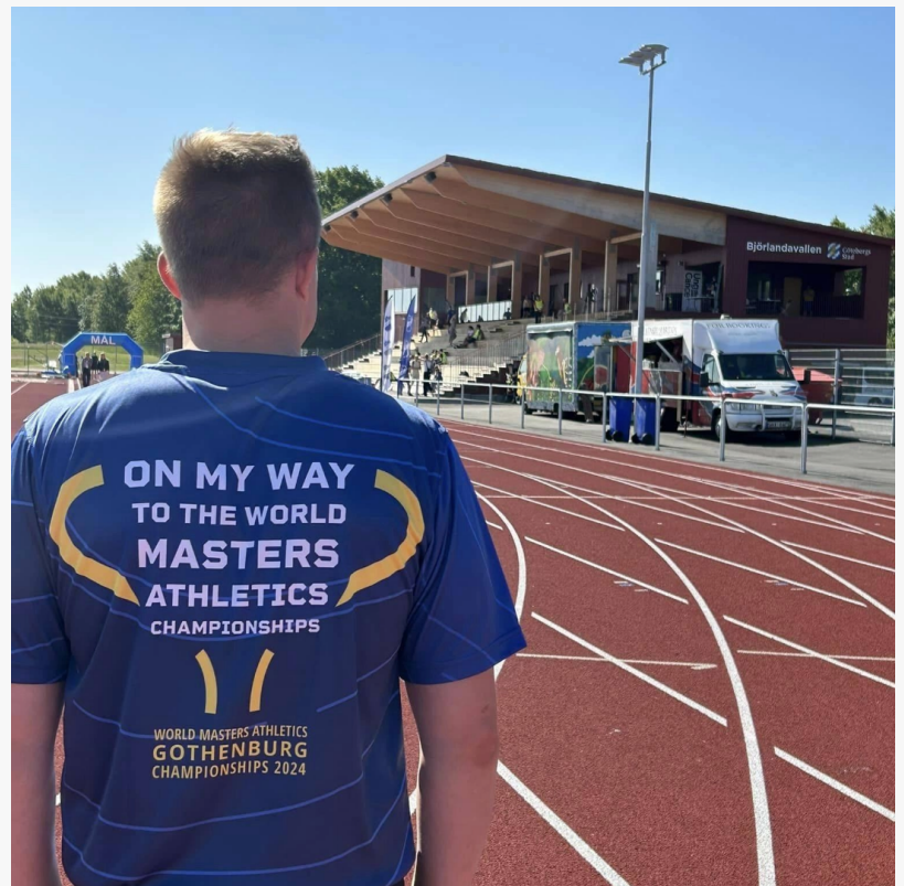
ON My Way to the World Masters Athletics Championships in Gothenburg