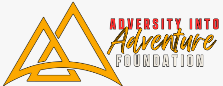
Adversity Into Adventure Logo