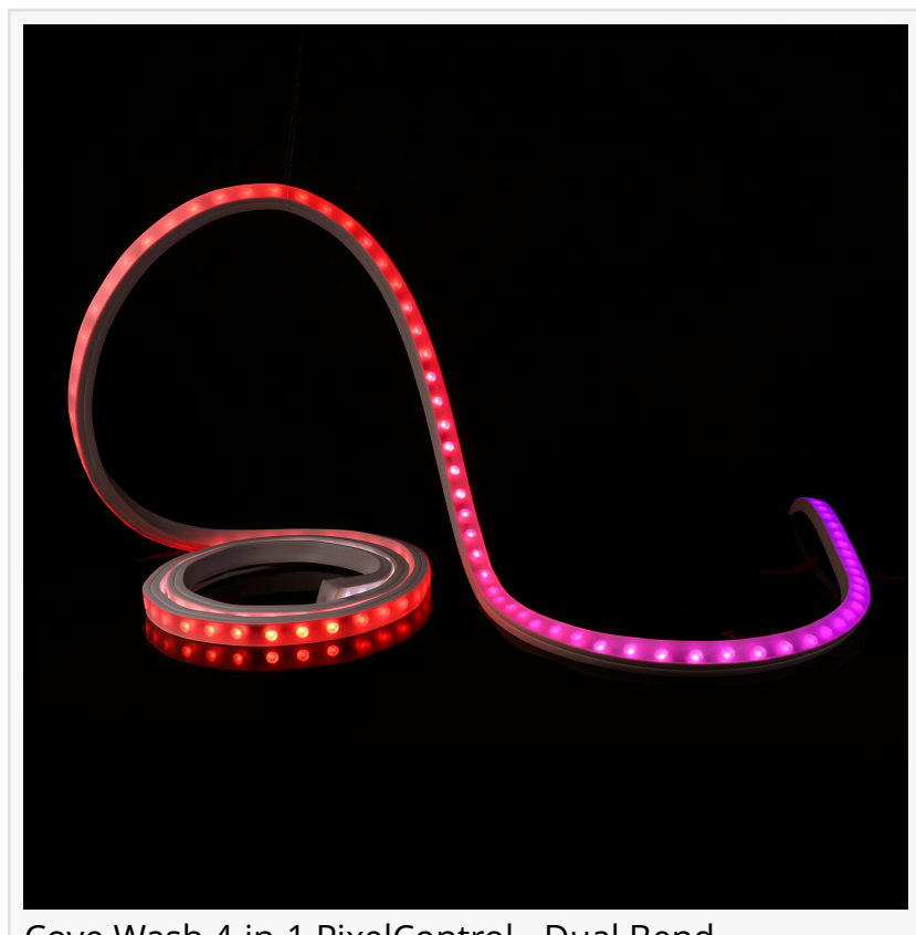
Cove Wash 4-in-1 PixelControl - Dual Bend

Cove Wash - Dual Bend is an innovative, low voltage lighting solution that simplifies cove light installations and provides a high lumen output. Unlike traditional cove light fixtures, Cove Wash - Dual Bend flexes effortlessly on both horizontal and vertical axes, providing the ability to bend seamlessly around curves and contours.