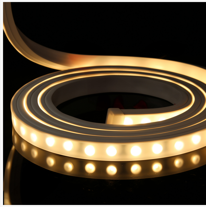
Cove Wash - Dual Bend - Monochrome

products. The first is a rigid aluminum mounting channel that keeps your lights perfectly straight and is sold in 2-meter segments. The second is a flexible aluminum mounting channel that bends and twists with your lighting and is sold in 1-meter segments.