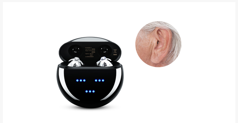
Chosgo SmartU rechargeable otc hearing aids