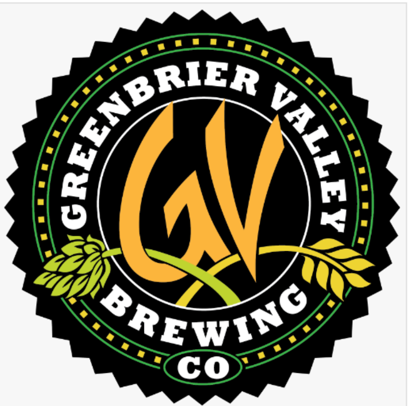
Greenbrier Valley Brewing Logo