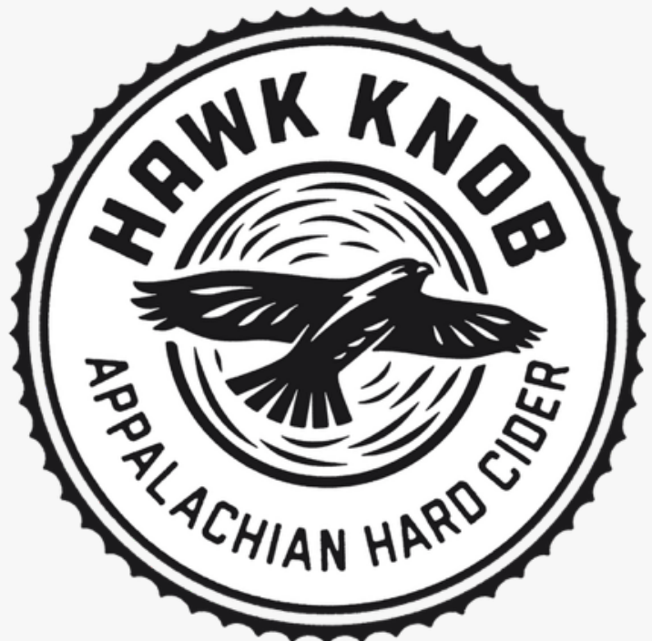
Hawk Knob Appalachian Hard Cider Logo