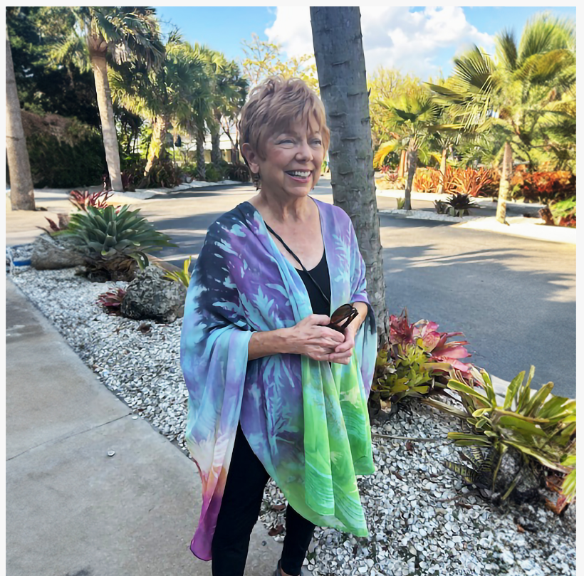
Art Meets Fashion

With distribution channels spanning from the Naples Art District, to the Mercato Artisans Market, and now on Amazon, LeighArtWear™ marks an exciting new chapter in this artistic journey. We're thrilled to embark on this new chapter and can't wait for you to experience wearable art fashion reimagined.