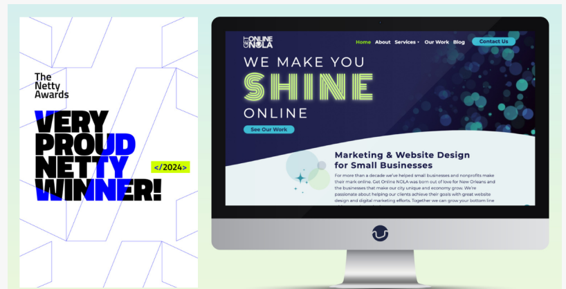
Image of Get Online NOLA Homepage

This press release can be viewed online at: https://www.einpresswire.com/article/723784393