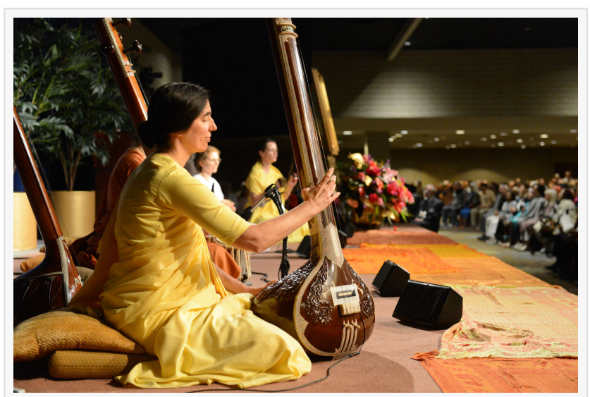
Nuns from Self-Realization Fellowship kirtan group at previous Convocation.

Convocation will be held July 14 to 20 — in person at the Westin Bonaventure Hotel in Los Angeles for the first time since 2019 — and livestreamed free of charge, so that anyone can participate from anywhere around the globe. Last year over 22,000 participants from more than