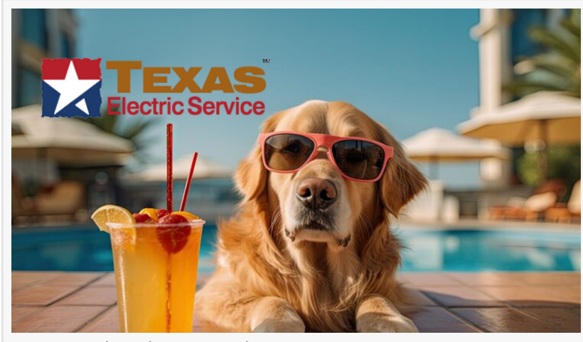
Stay Cool with Texas Electric Service!

Texas Electric Service, a pioneer in the Texas electricity market, introduces a new range of plans designed to meet diverse consumer needs. These plans include green energy options like wind and solar, alongside convenient