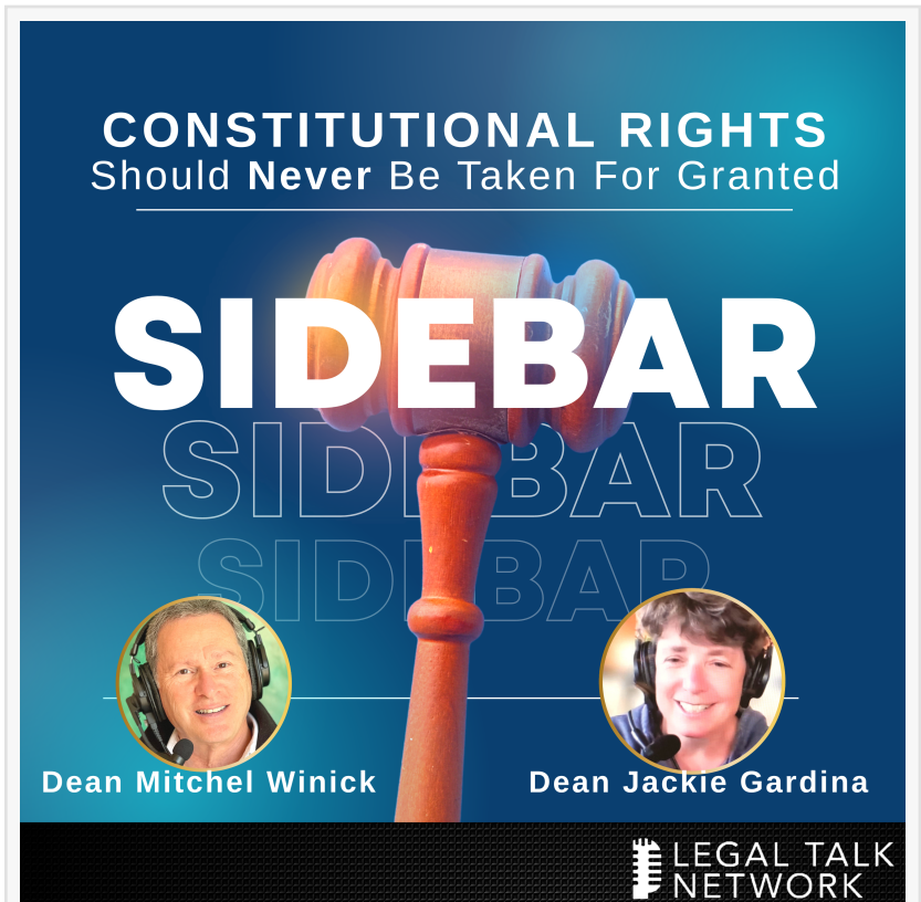
SideBar on Legal Talk Network