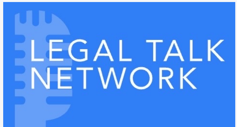
Legal Talk Network