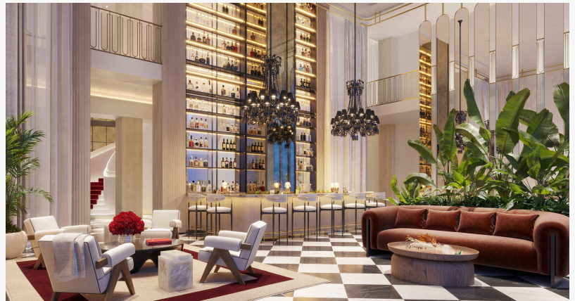
BACCARAT RESIDENCES MIAMI

This press release can be viewed online at: https://www.einpresswire.com/article/723907593