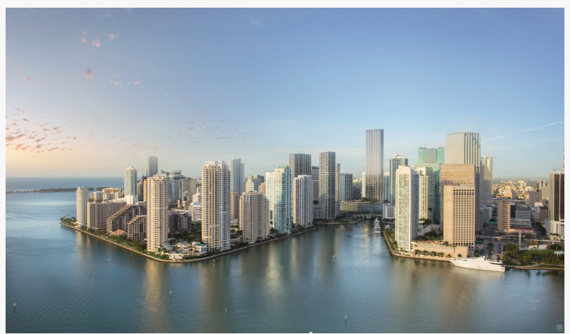
BACCARAT RESIDENCES MIAMI