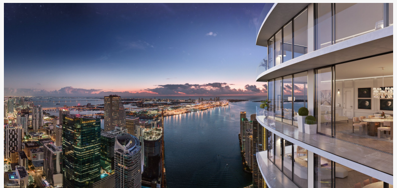
BACCARAT RESIDENCES MIAMI