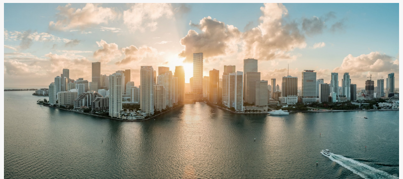
BACCARAT RESIDENCES MIAMI

Residents of Baccarat Residences Miami will enjoy a lifestyle defined by world-class amenities managed by SH Hotels & Resorts, including a La Mer hammam spa, Anatomy fitness center, and