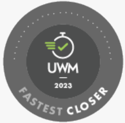
Fast Closer 2023