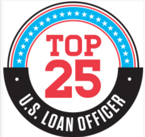
Top 25 US Loan Officer

This press release can be viewed online at: https://www.einpresswire.com/article/724111692