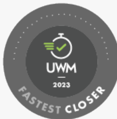
Fast Closer 2023

This press release can be viewed online at: https://www.einpresswire.com/article/724440890