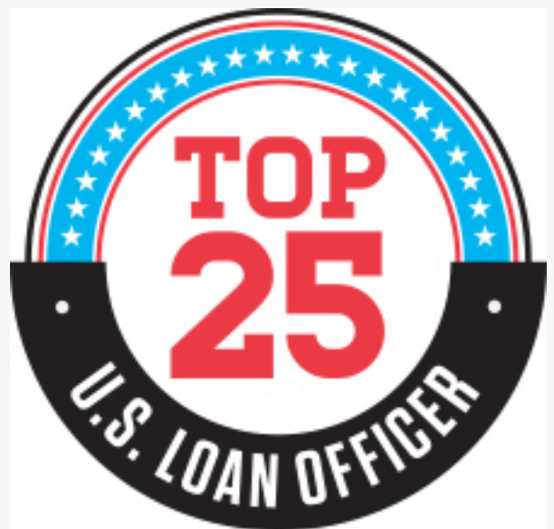
Top 25 US Loan Officer