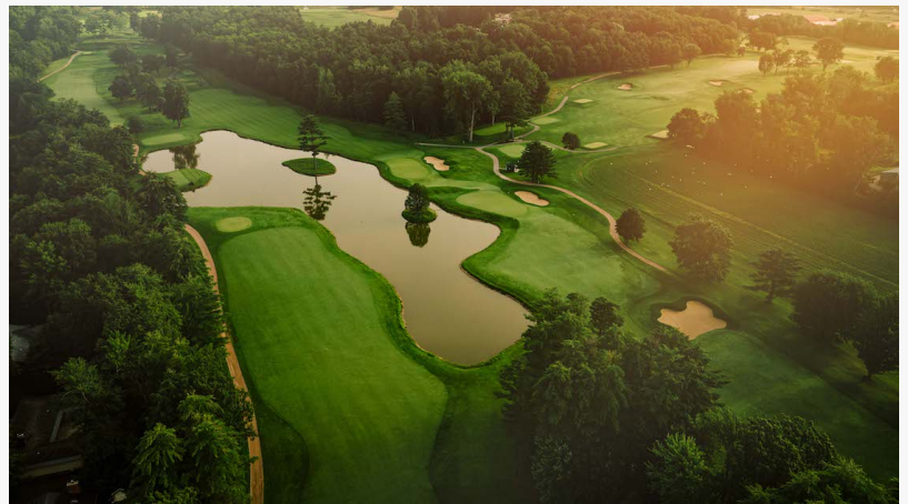
Burlington Country Club, the only Donald Ross course with concentric counter clockwise nines.