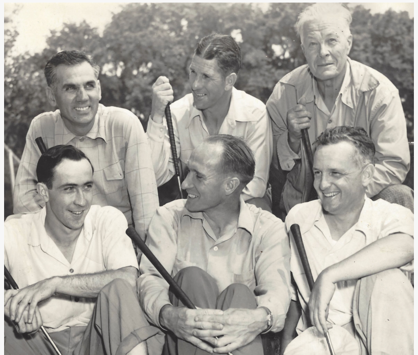
Burlington Country Club's 1947 Vermont Amateur McCullough Cup "Dream Team".