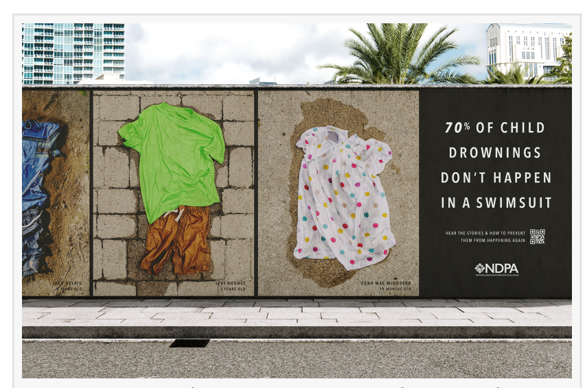
PSA Campaign Alerts Parents to Startling Stat that 70% of Drownings Involving Children Occur During Non-Swim Times.

TUSTIN, CA, UNITED STATES, July 2, 2024 /EINPresswire.com/ -- With reports of drownings reaching record levels in Florida and throughout the country, the National Drowning Prevention Alliance (www.ndpa.org) is working to inform parents about one of the most common and dangerous myths.