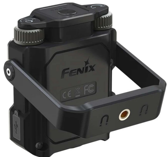
FENIX CL27R RECHARGEABLE LANTERN

Floodlight, spotlight, and features galore!