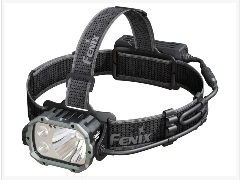
HP35R Standard Edition