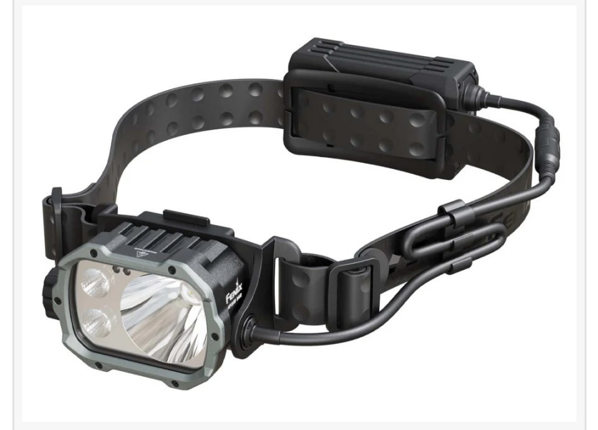
Fenix HP35R Search and Rescue Edition

environments, the HP35R features impact resistance up to 2 meters and an IP66 rating, making it