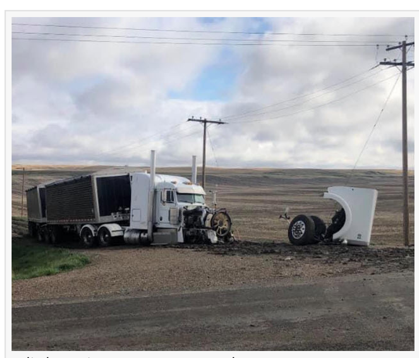
A little maintenance can go a long way

EDMONTON, ALBERTA, CANADA, July 4, 2024 /EINPresswire.com/ -- When it comes to commercial vehicle inspections, selecting a <u>trusted</u> and reliable shop is paramount. It's not merely about ticking off a checklist—it's about ensuring the job is done right and all defects are adequately addressed. Cutting corners to achieve a quick turnaround can lead to disastrous consequences, impacting both safety and business operations.