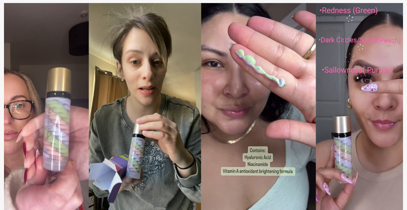
Liliduro Makeup Primer