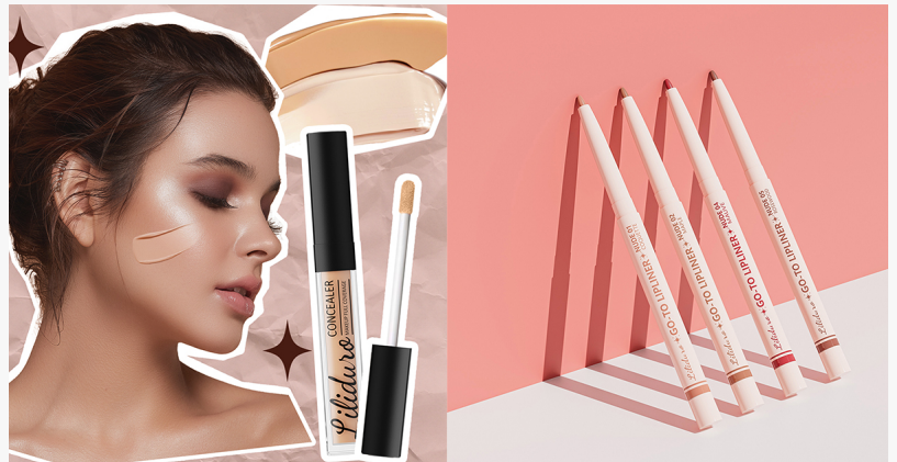
Liliduro concealer and lipliners