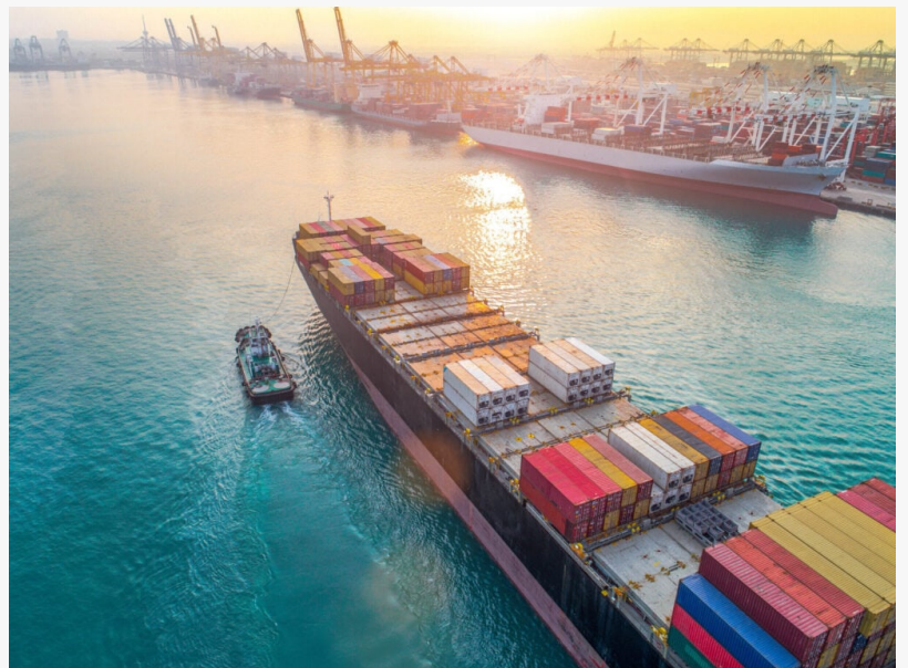
Maritime Cyber Security