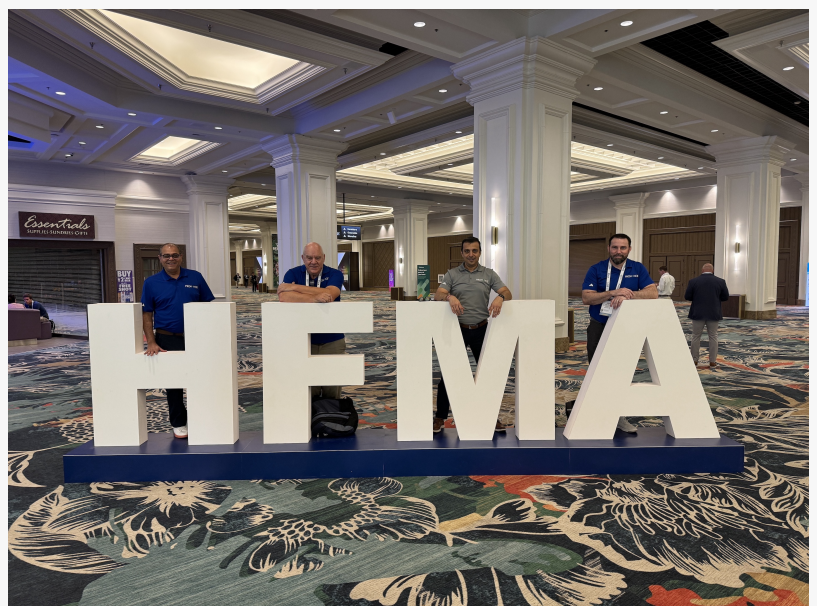
Team ProHance at HFMA in Las Vegas

About ProHance: Empower your organization with ProHance's comprehensive suite of tools and