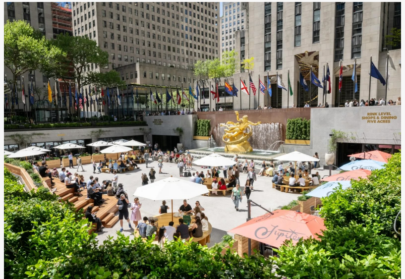
Rockefeller Center - Summer at the Rink

Beyond The Rink, Rockefeller Center continues to provide extraordinary experiences and memories for visitors and the world's top creatives. No visit to the Center is complete without taking in the more than 100 works of public art hidden in plain sight; experiencing the unparalleled 360-degree views at Top of the Rock Observation Deck; and riding The Beam, an interactive photo experience on the 69th Floor of 30 Rockefeller Plaza that recreates the famous