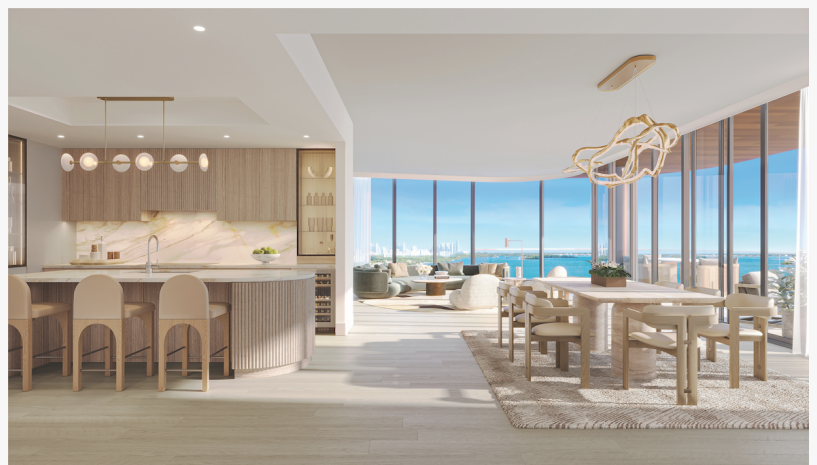
Solana Bay Great Room Miami Condo