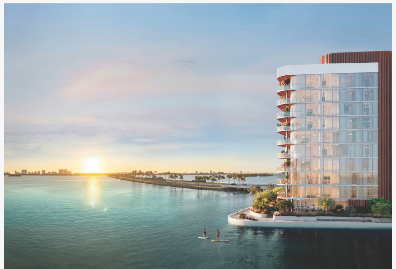
Solana Bay Condo View of Miami