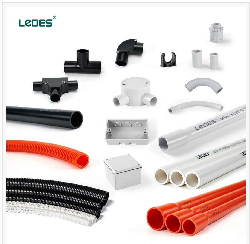
Ledes IEC & ASNZS Certified Electrical Conduit and Fittings

Solar conduit has additional requirements to UV resistance and fire resistance due to its special usage application. Ledes solar conduits have been subjected to long-term UV testing without any color change or performance degradation. This makes them well-suited for solar applications, where they provide reliable protection for electrical wiring and components against the damaging effects of UV rays. Solar conduits are manufactured using fire-resistant materials, they undergone rigorous testing to meet international standards such as CE, IEC, UL94, these tests ensure that Ledes conduit products exhibit exceptional fire resistance,