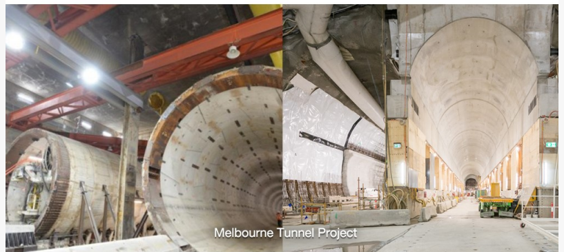
Ledes Construction Project in AU & SA